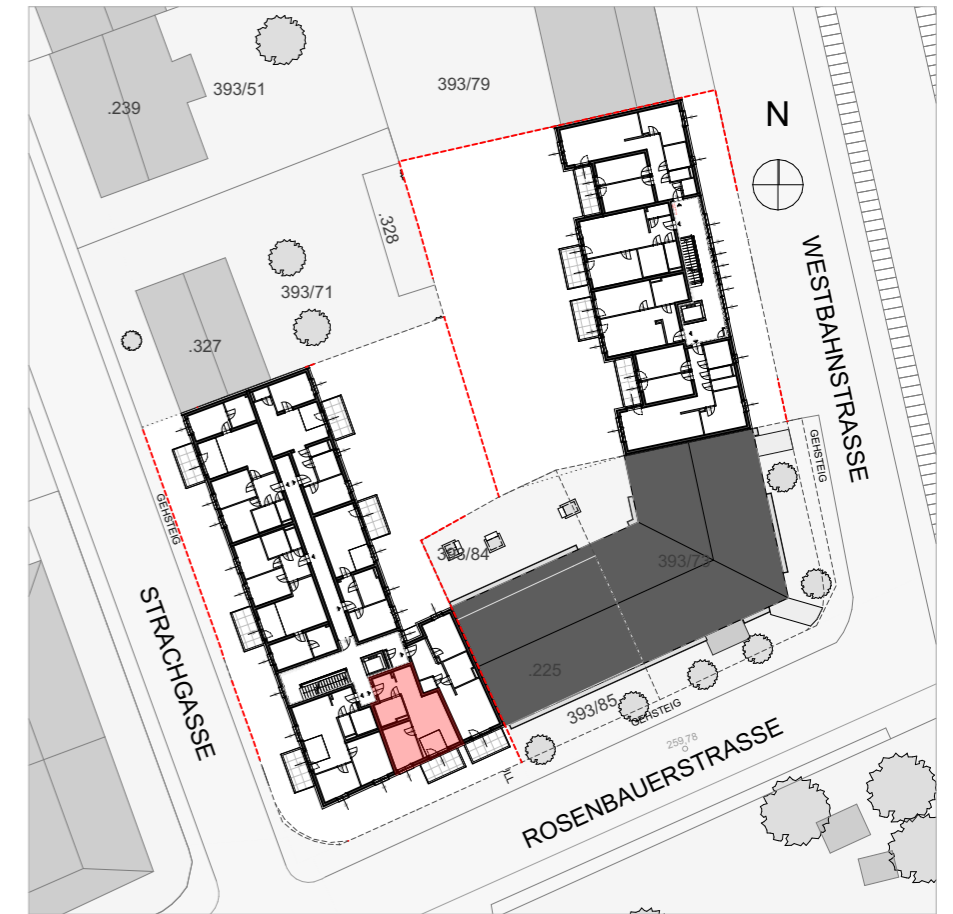
LAGEPLAN | M 1:500