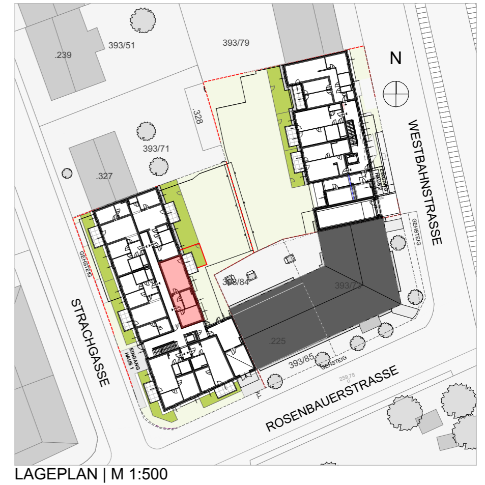
LAGEPLAN | M 1:500